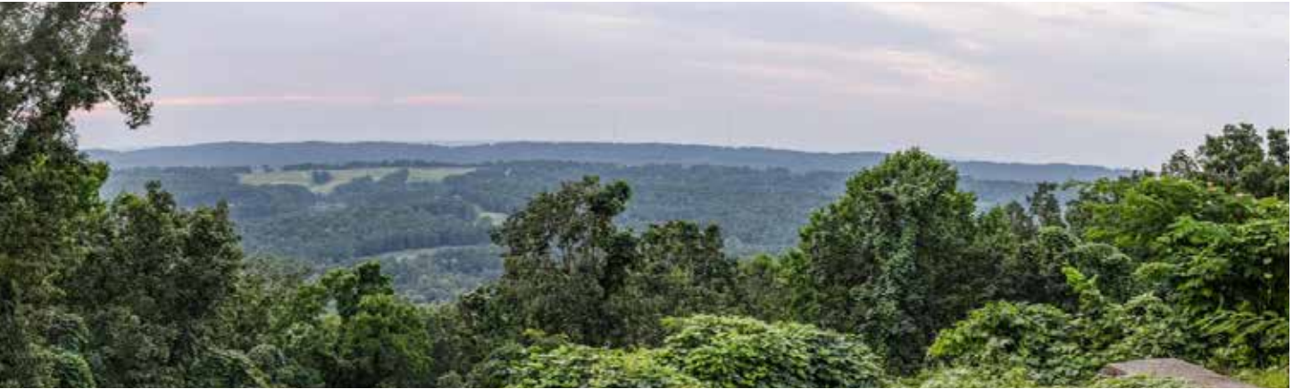
Bluff Park: Then (1908) and Now. Illustration and photograph of the view from Sunset Rock across Shades Valley to Red Mountain and beyond, courtesy Birmingham, Alabama Public Library Harvey Copeland Collection and Cliff Brane, respectively.