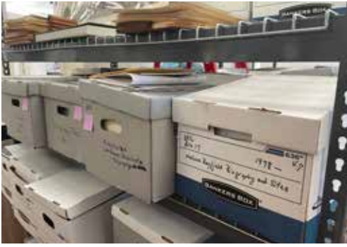
ABOVE: Birmingham Historical Society's research files assembled over the past 80 years on historic landmarks, districts, persons, and events are housed at its Highland Avenue offices, at Lakeview Storage, and at the Birmingham Public Library Archives.